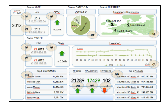
Figure 1: The business analytical dashboard used in the energy consumption test.

the implementations of greener NoSQL queries, Duarte and Belo (2017) gave a small but important step regarding the evaluation of NoSQL database management systems, with particular focus on document stores based systems. In this work we extend our experience on energy consumption evaluation in database, evaluating and comparing the energy efficiency between a relational and a non-relational DBMS supporting a business intelligence application that could be installed in a regular data center.